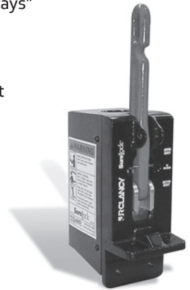
SureLock 010-600R US Patent 7,165,295

Rope locks are not designed to hold an imbalance of more than 50 lb (22.6 kg), nor to be used as a speed control.